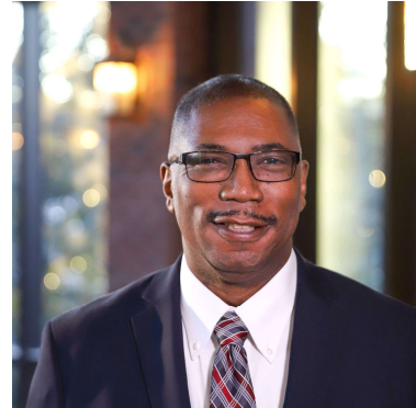
Mayor Craig Newton City of Norcross