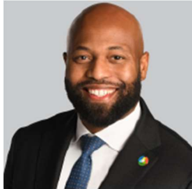
Commissioner Kirkland Carden Gwinnett County