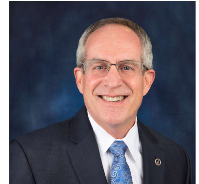
Mayor David Still City of Lawrenceville